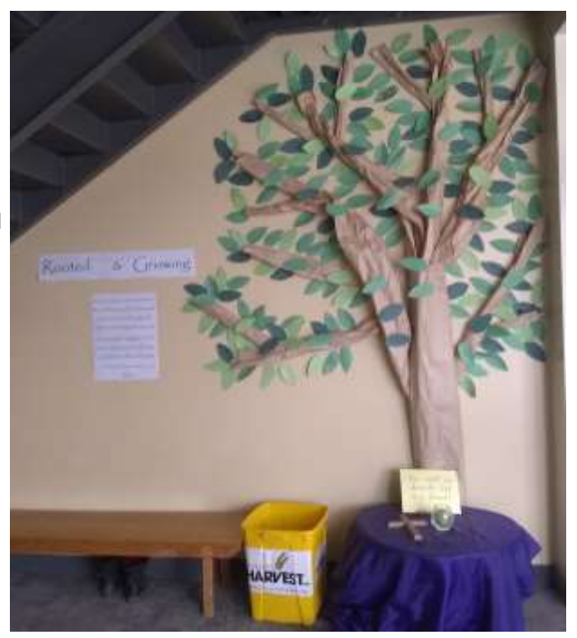
Our Lenten Tree—It began as a bare trunk at the beginning of Lent and has sprouted leaves with prayers and thoughts from all of the students as the weeks progressed.