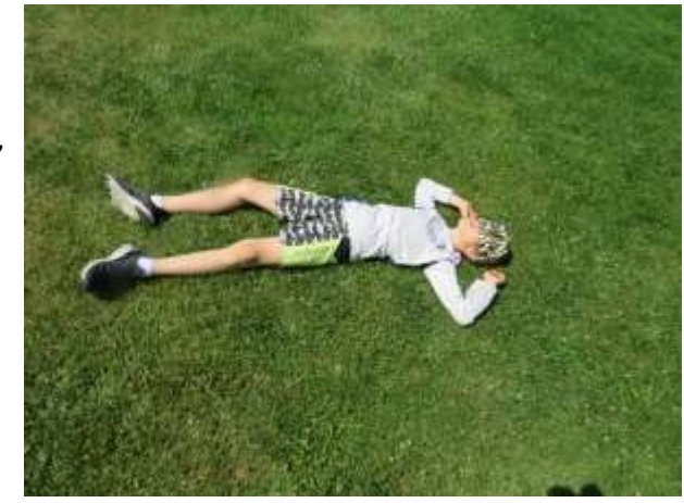
Ready for a break!