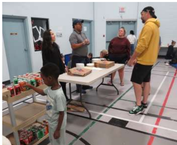
Members of our PALS helping with our Terry Fox event

This fall, PALS jumped right back into action by organizing the Wine Tasting event in September and the Halloween Social in October—both extremely well attended and lots of fun. We also supported the Terry Fox Walk / Meet the Teachers event by providing and distributing pizza and beverages. These events would not be possible without the amazing support of our parent volunteers. Thank you for giving your time and energy—your involvement truly makes a difference!